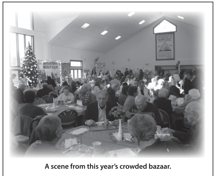
A scene from this year's crowded bazaar.