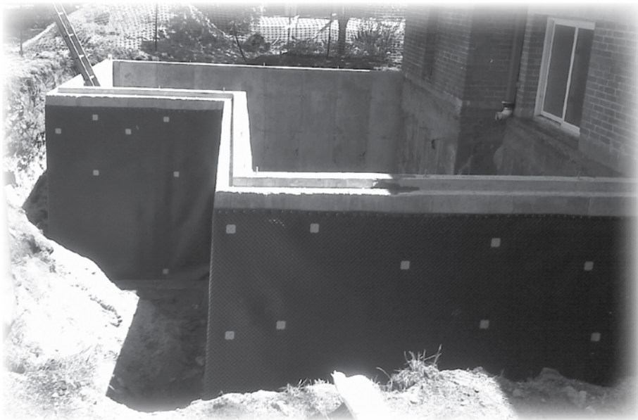
The foundation is complete.

connecting the addition to the church lobby and sanctuary. Files, records and archives currently stored in the Trustee office will be moved downstairs to declutter the office. The building fund is still in need of contributions to meet our goal. Please consider a generous donation and watch for updates on the final completion and opening date.