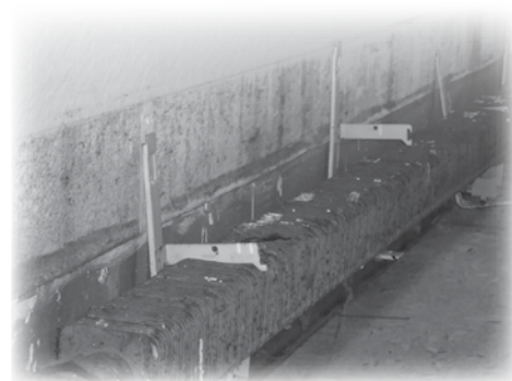
A mold and mildew problem was discovered behind church walls during construction this summer. A full clean up of the mold and restoration of the walls was completed.